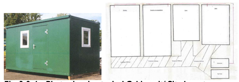
Fig. 3 & 4 - Photo showing typical Cabin unit/ Site layout

2. Planning permission is sought for the erection of a remote temporary 'camp' for a period of 7 months from Spring 2012. The camp would include 2 temporary accommodation units, a toilet unit and a store, all sited on a terrace above the watercourse. The proposed units are prefabricated galvanised steel structures and would be airlifted in to site.