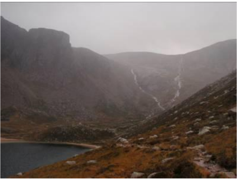
Fig. 5 - Site locality showing topography