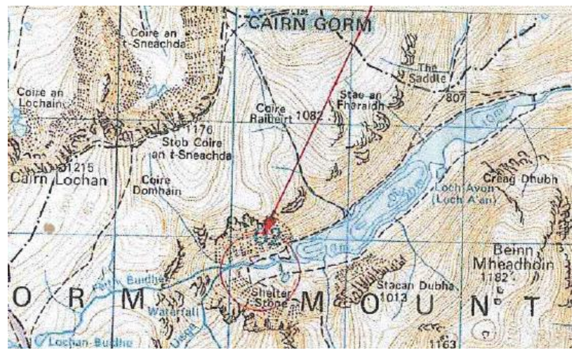
Fig. 2 – Site Location (further detail)

1. The application site is located adjacent to the Garbh Uisge ('The Great Rough Water') to the west of Loch Avon. The site is located in a remote upland area close by to a number of high level walking routes. It is within the Cairngorm National Scenic Area, National Nature Reserve among a host of other designations. The site itself (see figures 5 & 6) sits within a broad valley floor and features a small area of rough grass used for wildcamping.